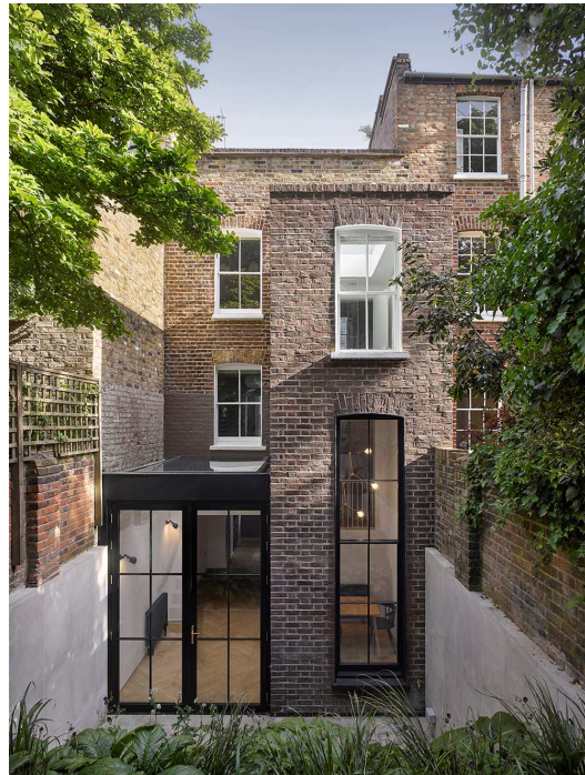
Tower House, Islington