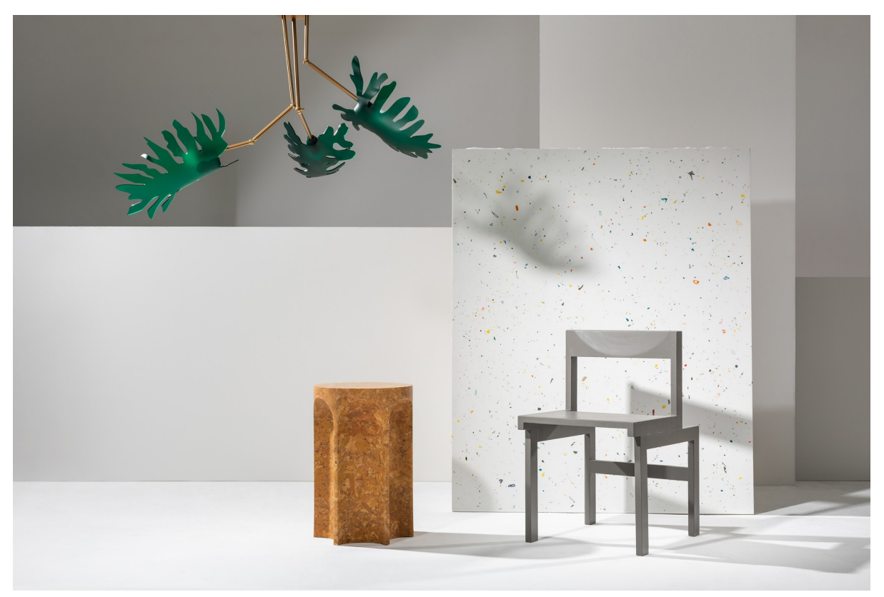
Local Heroes at LDF--Photo Reuben Paris--CLOCKWISE--Urpflanze 'The Lacy Tree Chandelier'--MIRRL 'Fossil' Surface Material and '400' Chair--Chalk Plaster 'Wemyss' Side Table