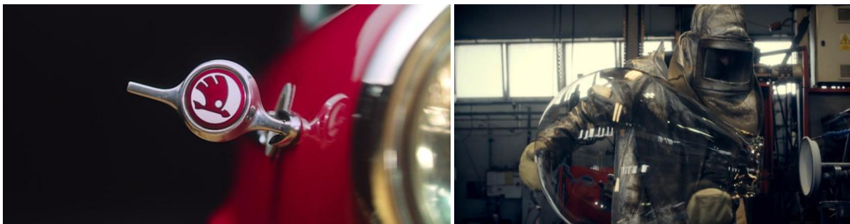
Stills from the animated films ŠKODA (left) and BOMMA (right), Design and Transformation exhibition, 2022