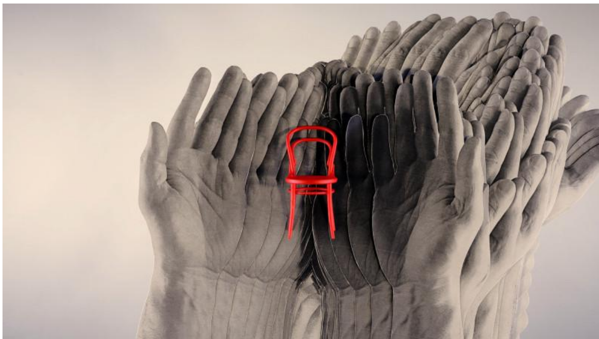
Still from the animated film (TON), Design and Transformation exhibition, 2022, © Collective of authors led by Michaela Režová, UMPRUM Archive

Two interconnected exhibitions showcasing stories of Czech design will be on show in Notting Hill this September as part of this year's London Design Festival. Whether you're interested in current Czech design, from traditional glassware to technology-driven innovations, or intrigued by design development over the last thirty years, Design and Transformation is a brilliant starting point to learn more about the ever-evolving Czech design rooted in the country's rich cultural and craft heritage.