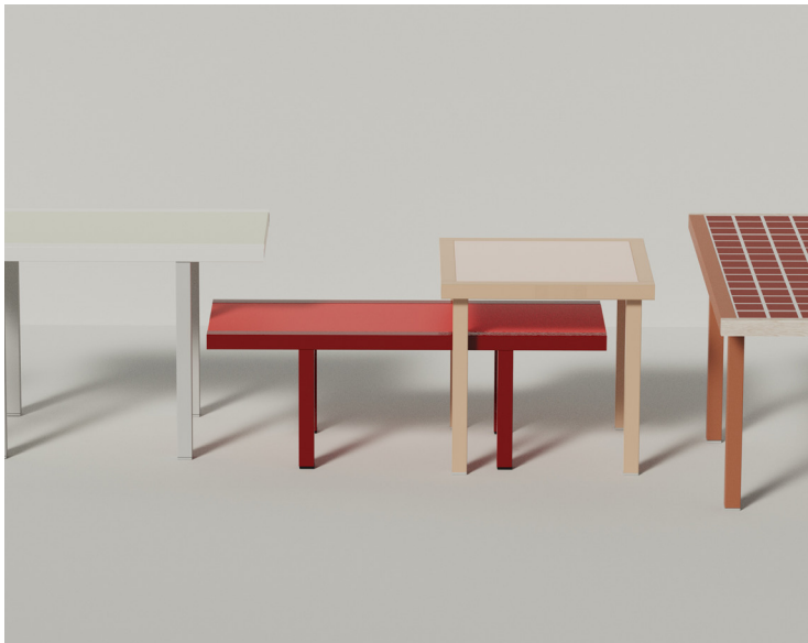
Visuals of tables.

This presentation continues the trajectory of the Standard Medium series, first shown at Raw Senses (Zurich, 2023) with a bench and later at Second Nature Projects (Zurich, 2024/25) with some plinths and side tables.