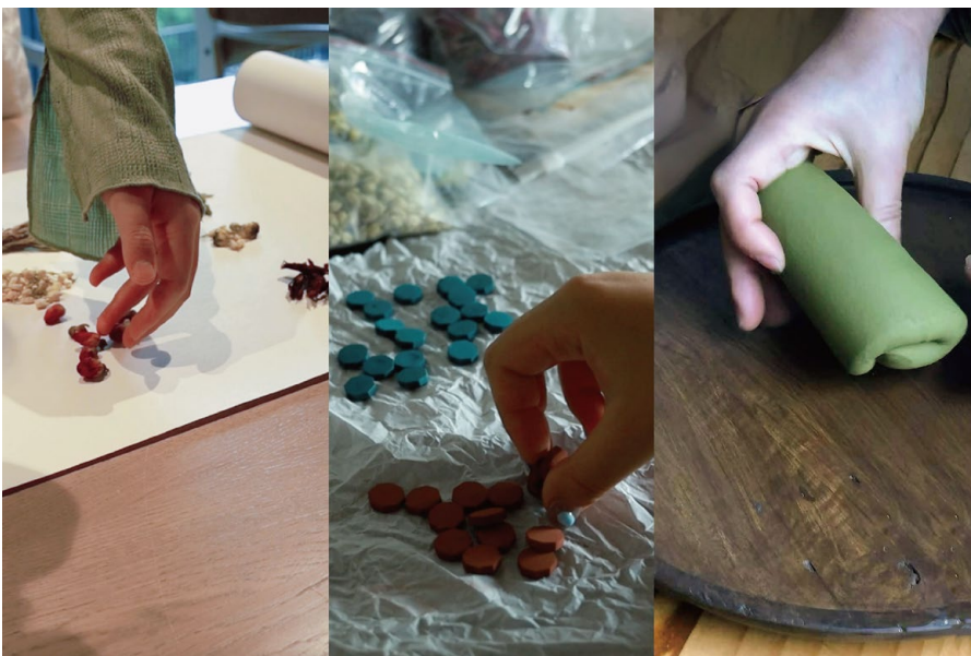
Figure2: The craftsmanship process of handmade scent core, ScentPrint Studio