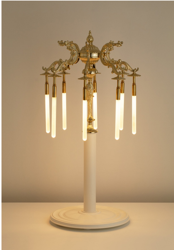
Droop (Eight) 2024