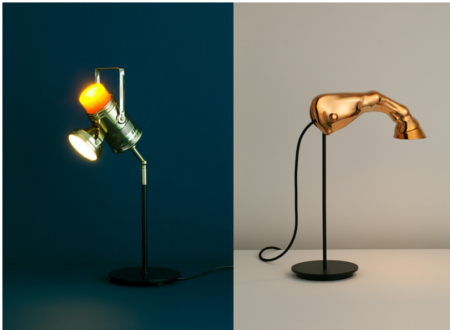
Dome Light (2024)