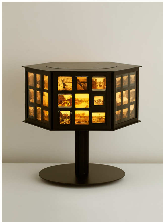
Magic Lantern (2024)