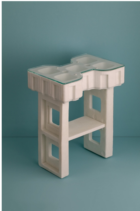
Memory Table (Butterfly) 2024