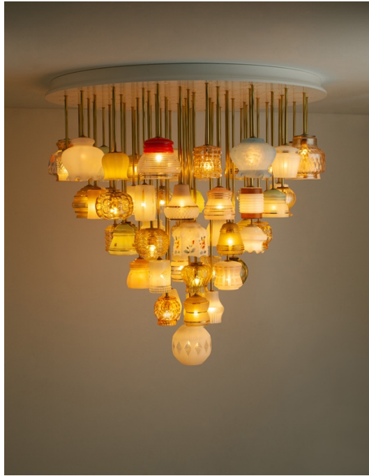
Shadey Family (2024)