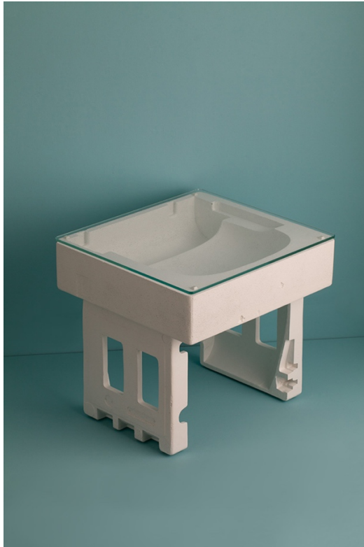
Memory Table (Scoop) 2024