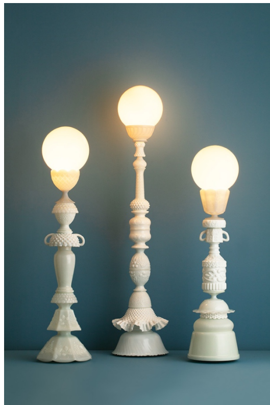
Milk Moon lights (2024)