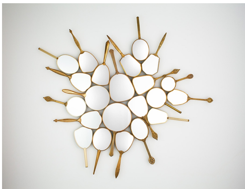
Selfie (Brass) 2024