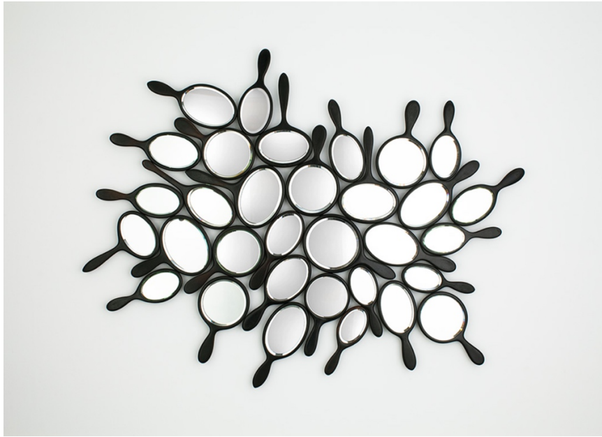
Selfie (Ebony) 2024