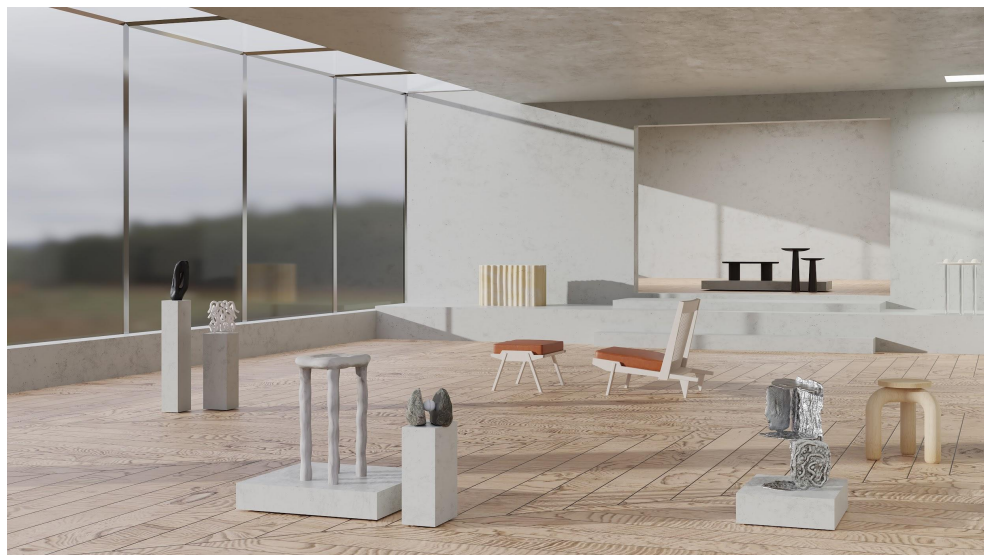
The Norwegian Virtual Exhibition

The Norwegian Collection London, UK London Design Festival 18-26 September 2021