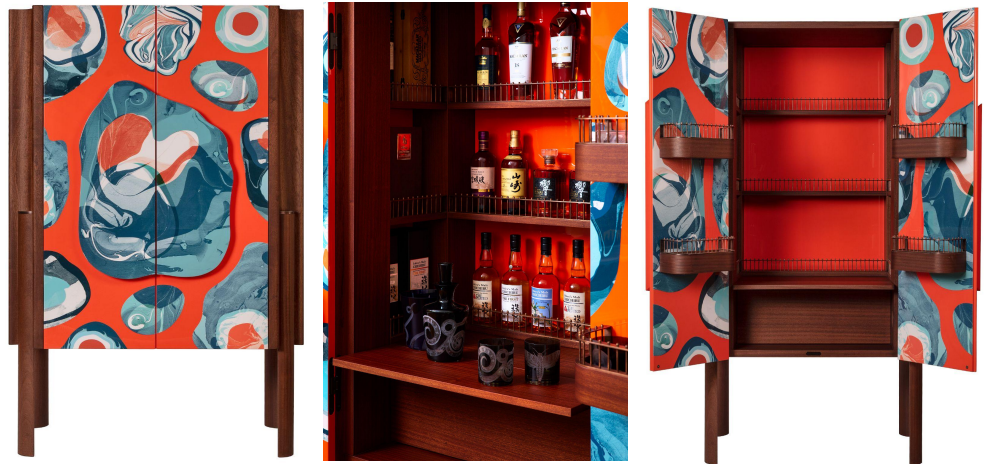
Image credit from left to right, Meyhane Cabinet Cut Out © Sinan Çırak, Nazar Cabinet inside detail © Luke Walker, Meyhane Cabinet Cut Out © Sinan Çırak

AHU London Design Festival 18 – 26 September 2021