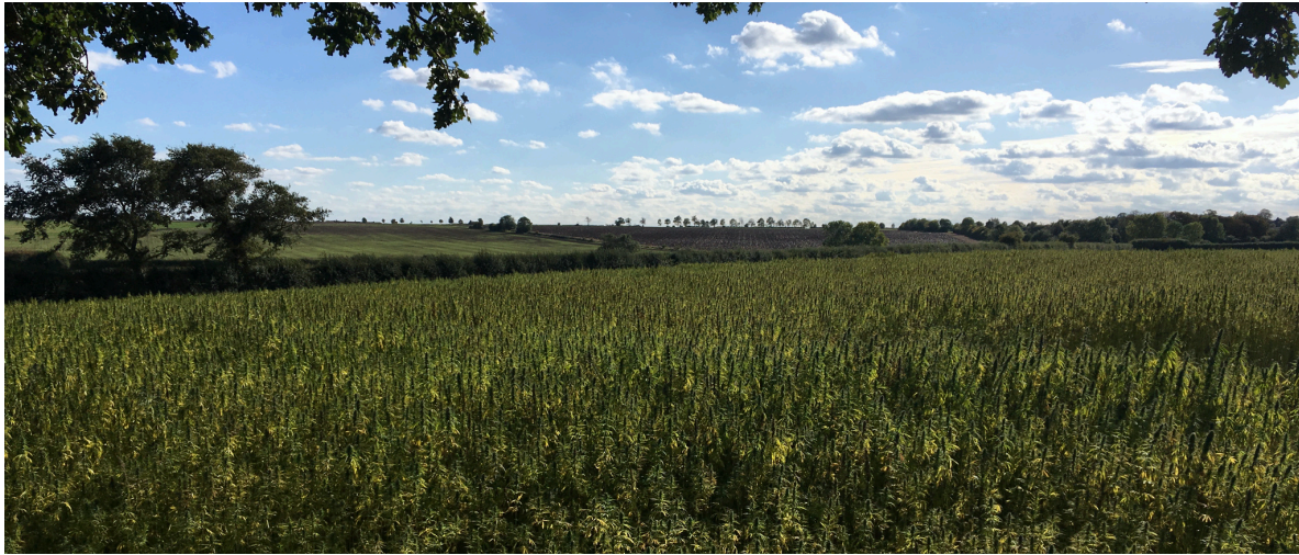
Margent Farm, Cambridgeshire

The fully automated 24/7 retail, COVID-safe, contactless Hemp Automat will stock products from Margent Farm, Kvadrat, BUAISOU, HempWood, HOLM and many more brands.