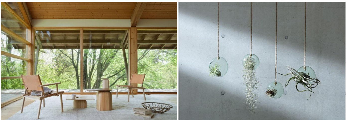
Above – December lounge by Nikari and The Canopy collection by LSA/Eden Project

British furniture brand VG&P (Very Good & Proper) is debuting its first sustainable outdoor collection, which features biocomposite technology from the Swedish company Trifilon. This material combines recycled plastic and hemp – that draws down and captures carbon as it grows - fibres to create a product that will not only stand the test of time as a quality piece of furniture, but it also produces about 85% less CO2 than a regular plastic chair. It can also be recycled again, meaning fewer raw materials are required to breathe new life into it.