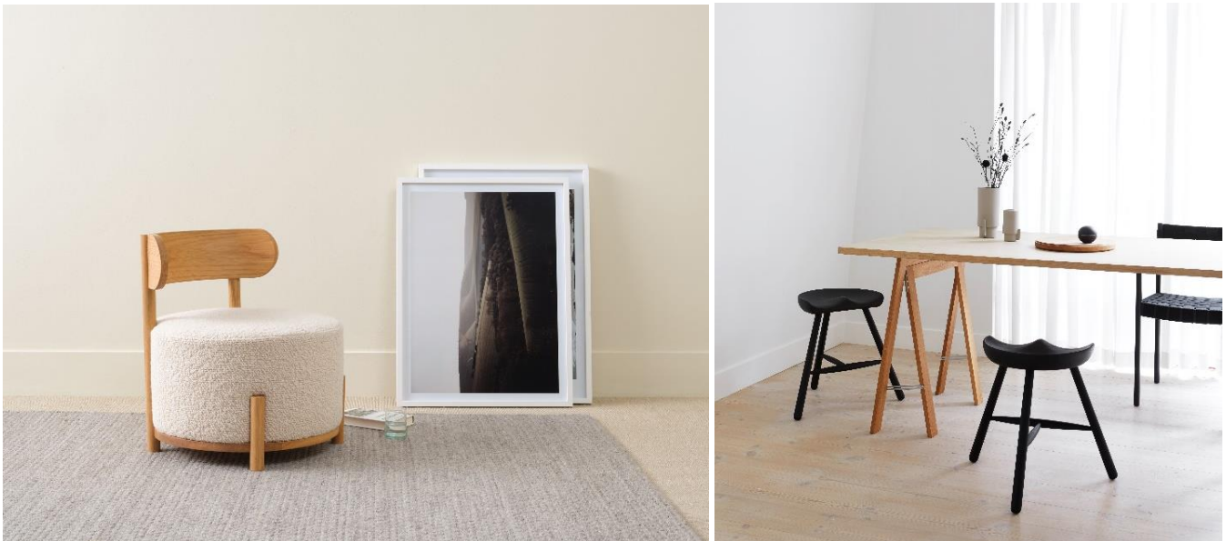
Above – Farmhouse chair by Another Country and Shoemaker chair by Form & Refine

British glassware brand, LSA has been producing high-quality original designs to enhance our modern environment since 1966. They work closely with some of the world's most skilled artisans exploring new techniques that push the boundaries of handmade glass production, ensuring quality and longevity. At Planted, LSA will present Canopy, a collection of sustainably produced products in collaboration with the Eden Project. Centred around the concept of hydration and propagation the collection features an array of glasses, vases, bowls, hanging planters and closed gardens.