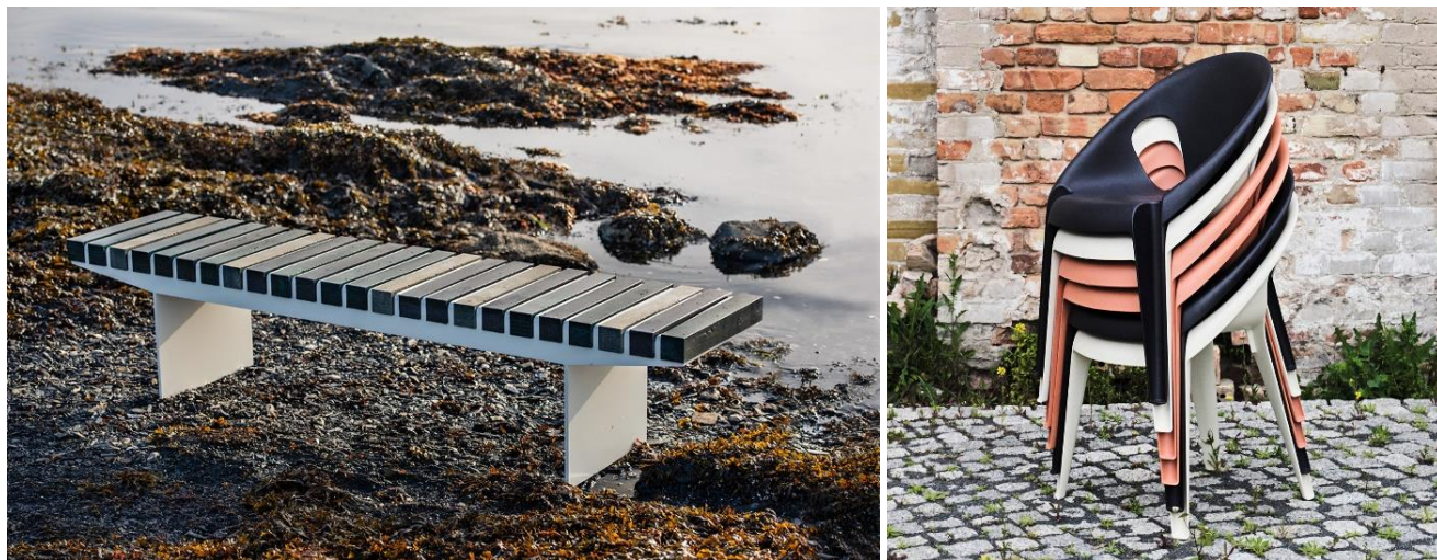
Above – Coast bench by Vestre and Bell chair by Magis