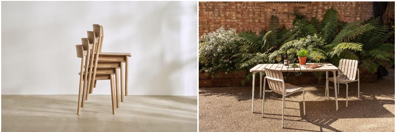
Above - Ovo chairs by Fosters & Partners for Benchmark and Latte chair by VG&P

Brands include: Teer & Co, Form & Refine, Nikari, Woodnotes, Less is Better, Naturalmat, Plant Designs, Benchmark, LSA x Eden Project, Another Country, VG&P, HagenHinderdael, Yarn Collective, Magis, Fora Form.