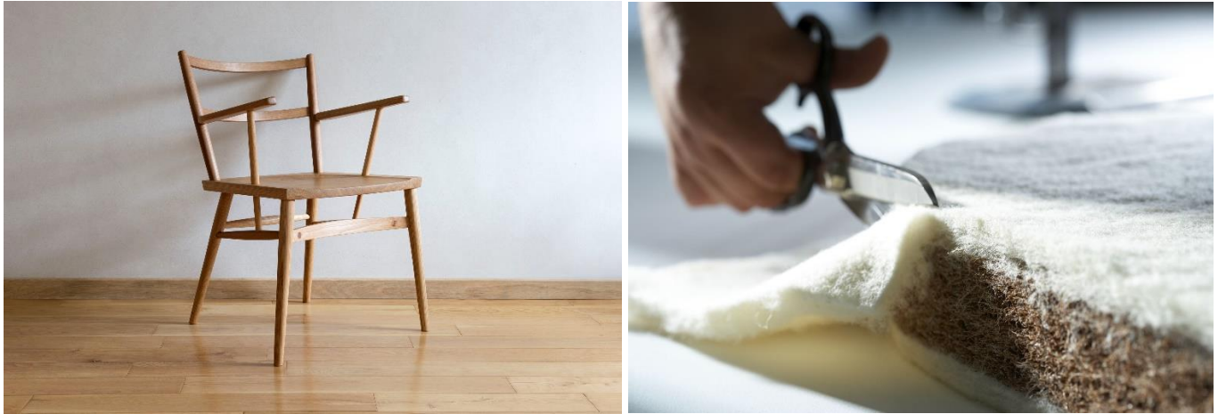
Above – Leo chair by Teer & Co and Naturalmat organic material

Independent British home furnishings brand Teer & Co offers a timeless, elegant collection of made-to-order and sustainably-sourced timber products. With the aim of bringing the outdoors in responsibly, and investing in our well-being, Teer & Co embeds genuine provenance and soul into its timber furniture, wall panelling and sculptural objects.