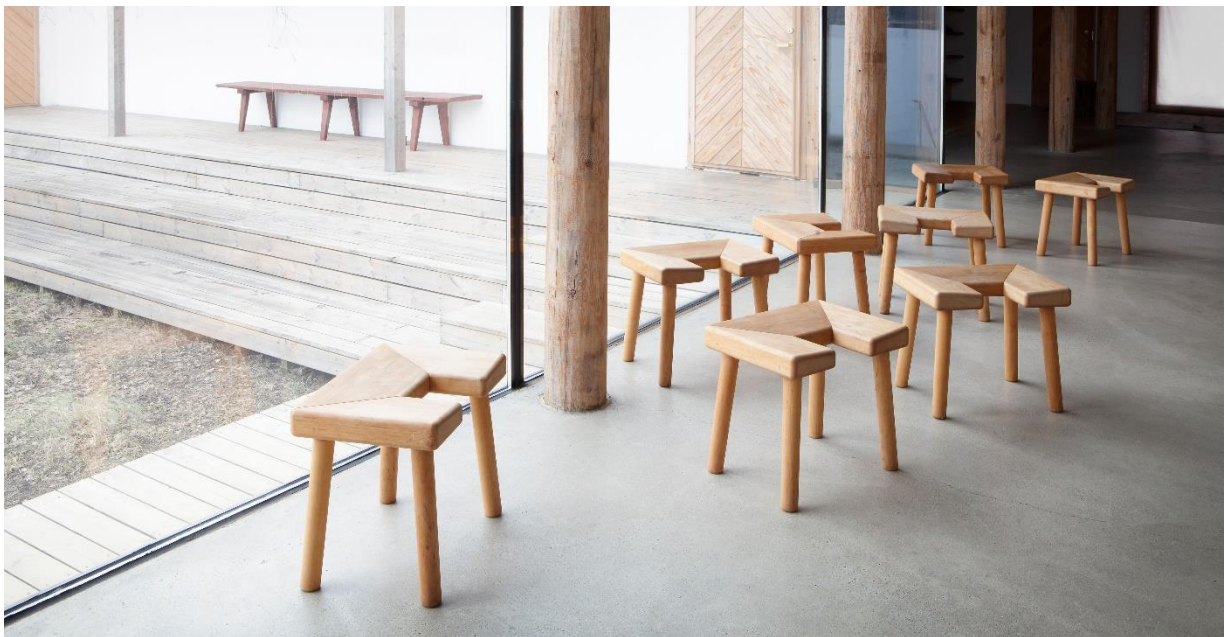
Above: Arte Culture Sauna stools by Nikari

Planted, the new contemporary design show aimed at reconnecting people and spaces with nature will launch its flagship show this September at King's Cross London.