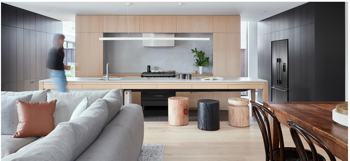
Above - Fisher & Paykel

Pairing product design with art HagenHinderdael's work explores the relationship between lighting and large-scale installations in immersive environments. At Planted they will be presenting Twine a 3d printed modular seating system made entirely of r-PTEG from medical tray waste as well as the Cocoon pendant light collection, which transforms wood waste into an organic, technology advanced light.