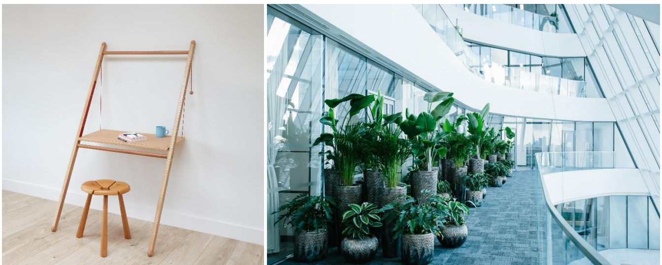
Above – Lean desk by Less is Better and Plant Designs office project

Over two decades ago, keen sailors Mark Tremlett and Peter Tindall began experimenting with the use of breathable, natural fibres as an alternative to synthetics commonly used on boats. In 2000 Naturalmat was born, with an ethos of using only raw materials which were natural, sustainable and, wherever possible, certified organic. Naturalmat will be exhibiting their bedroom range, which includes bed frames, mattresses, storage benches, pillows and duvets all made by hand.