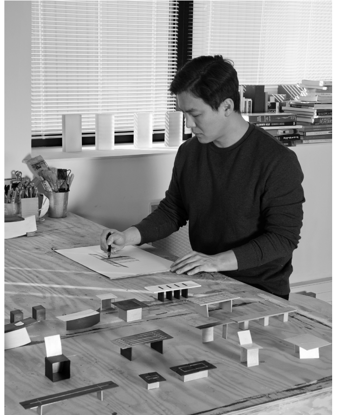
WONMIN PARK

LONDON | CARPENTERS WORKSHOP GALLERY