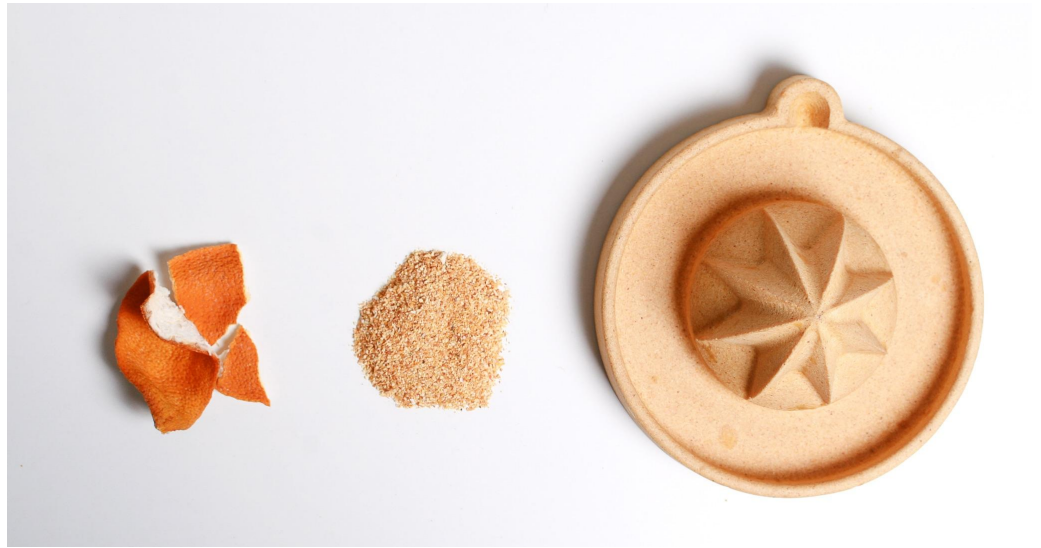
Studio ARP