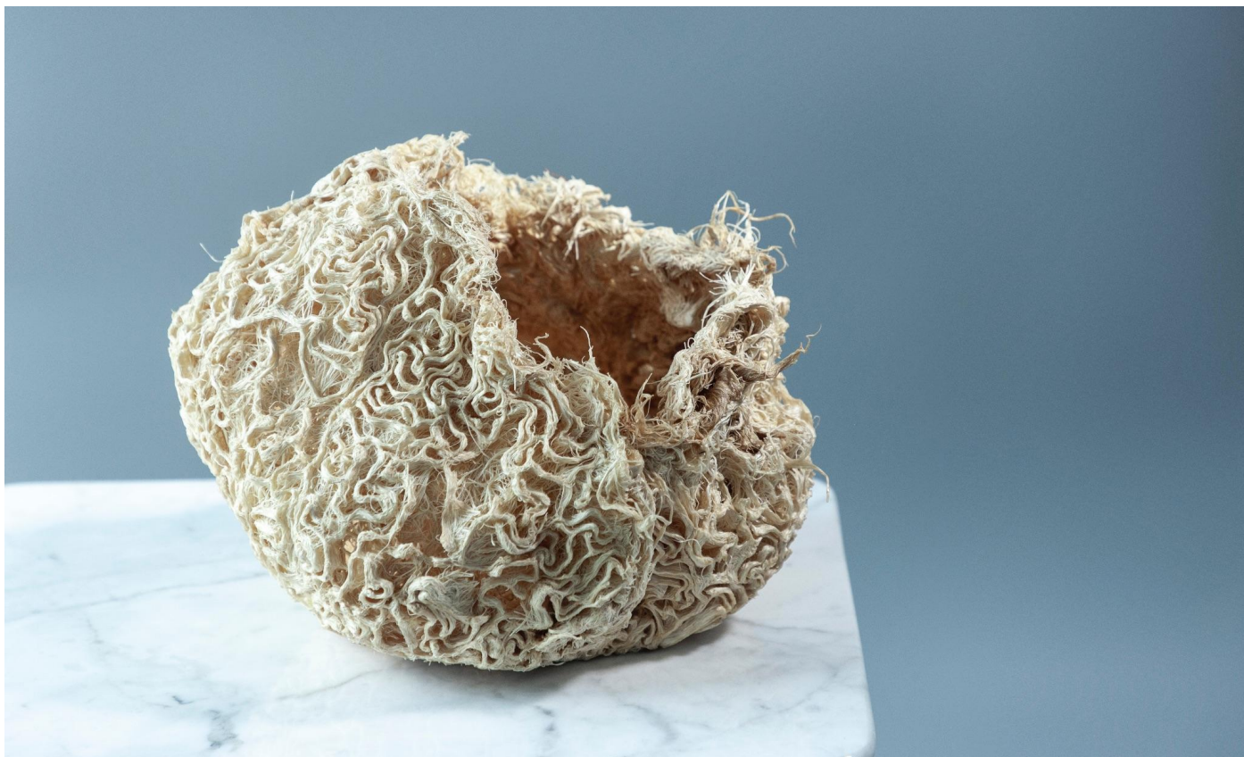
Zena Holloway