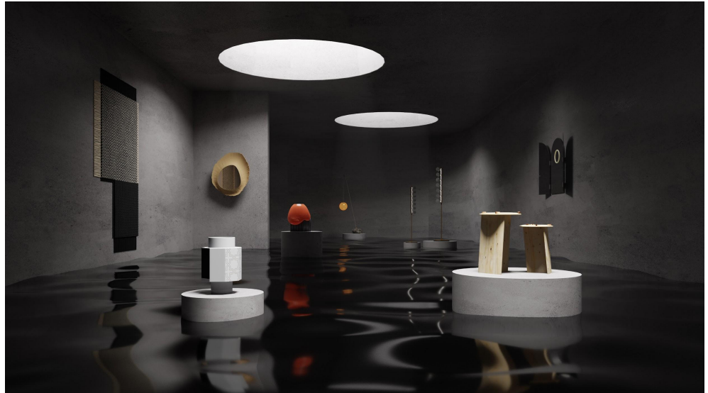
The Dutch Virtual Exhibition

The Dutch Collection London, UK London Design Festival 18-26 September 2021