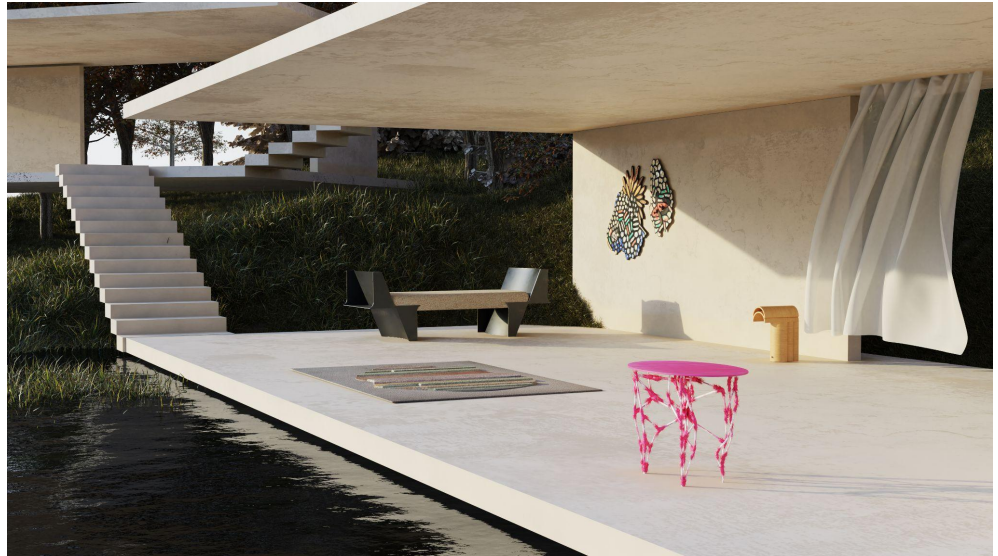
The Lithuanian Virtual Exhibition